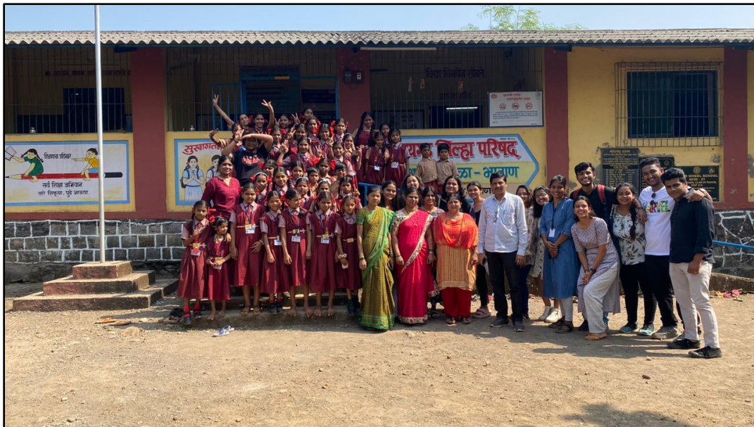
Community Radio students with Raigad Zilla Parishad Prathmik Vidyalay students and teachers